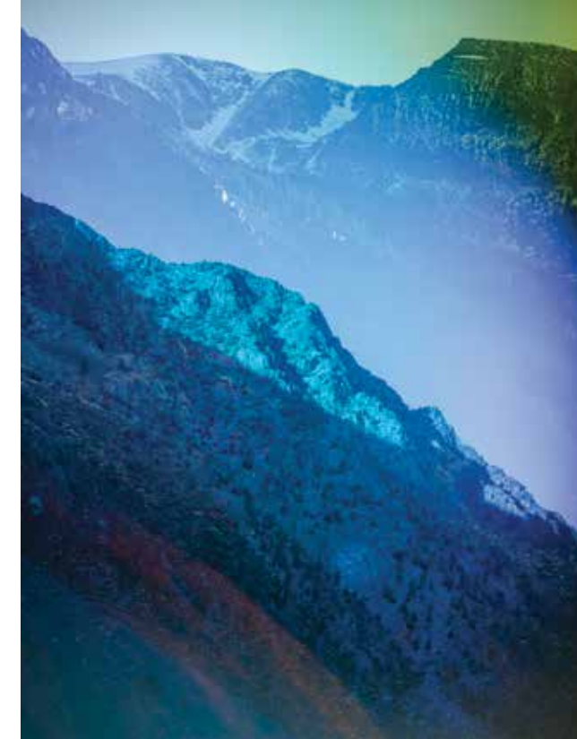
Psychscape 30 (Excelsior Ridge, CA)