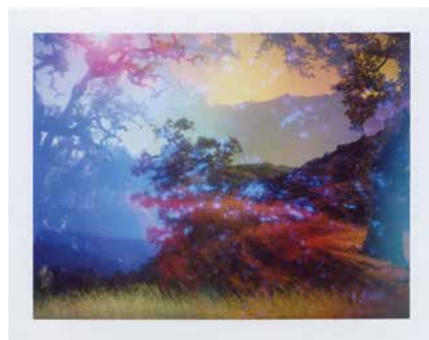
Creature Comfort 08 (Cahto Peak, CA)

“Psychscapes,” a term that aptly sums up how her mesmerizing creations simultaneously capture both the real-world scene and her emotional response to it. Back home in Oakland, California, she has them printed in large-format limited editions that have earned a place in cutting-edge galleries.