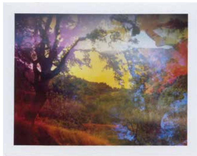
Creature Comfort 09 (Sanel Mountain, CA)

The result is what Loewenthal refers to as one of her